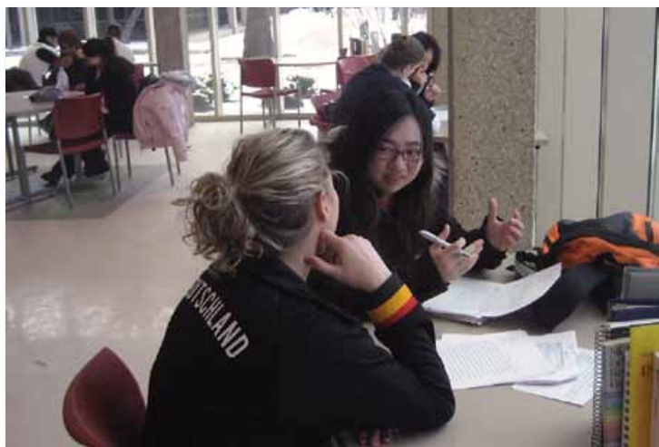
Students working in the Writing Center.